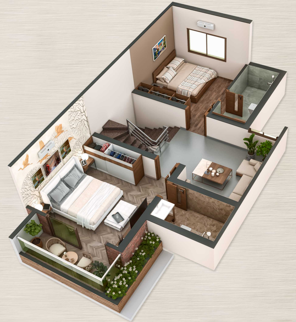
ISOMETRIC VIEW OF FIRST FLOOR