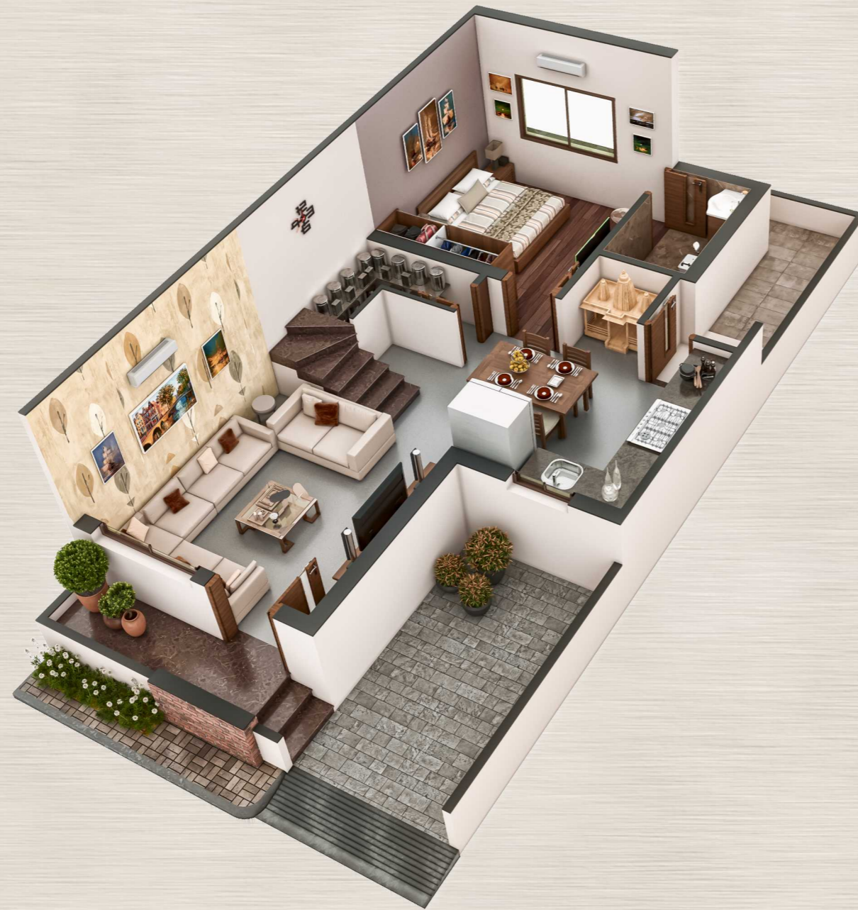
ISOMETRIC VIEW OF GROUND FLOOR